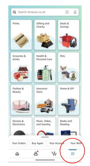
Step 3: Scroll down to AmazonSmile and tap.

Step 1: You need to navigate to this screen. To get here tap the three lines circled in red below.